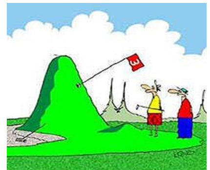
"I hear this is one of the tougher greens to putt on."