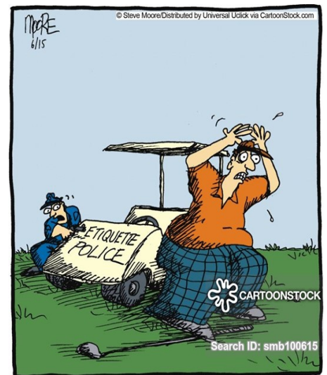
"Get down on the ground! DOWN ON THE GROUND!!!"